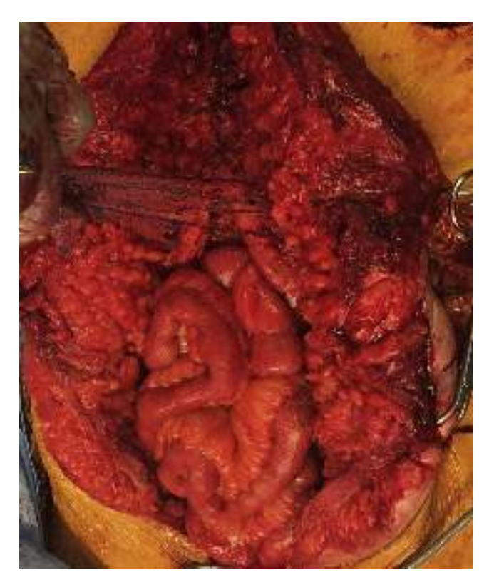
Fig. 3. Abdominal wall closure with mesh sutured technique underway. Lateral incisions for perforator preserving anterior components release are just visible.

preservation is performed for larger defects through laterally placed incisions. The decision to perform a components release was made intraoperatively based on an inability to bring the medial borders of the rectus muscle with simple finger traction.