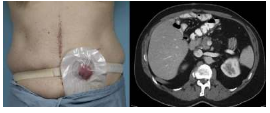
Fig. 7. Same patient 21 months later after successful abdominoperineal resection, permanent colostomy, anterior components release with perforator preservation, and mesh sutured closure.