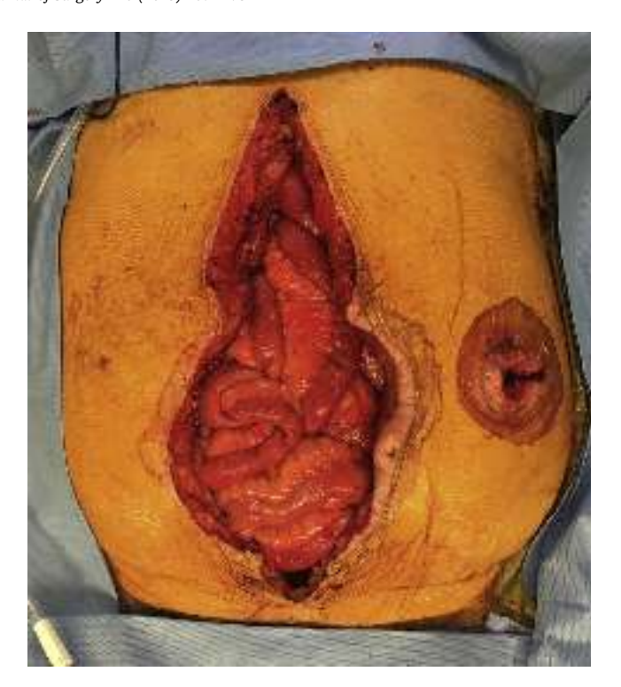
Fig. 2. Appearance after removal of skin graft and ostomy takedown.

preservation is performed for larger defects through laterally placed incisions. The decision to perform a components release was made intraoperatively based on an inability to bring the medial borders of the rectus muscle with simple finger traction.