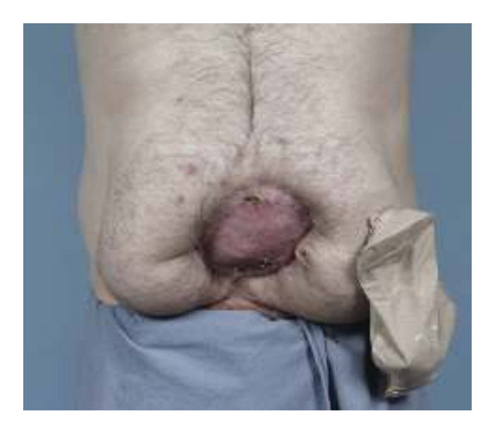
Fig. 1. A 35 year old man with a skin grafted midline hernia presents for an ostomy takedown.